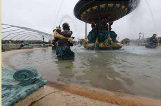
Fontaine des Fleuves, Place de la Concorde, Paris

The Submerged Time exhibition brings together a diverse group of artists who engage with water not merely as a theme, but as a dynamic language, a source of life, a space for healing and transformation, and a vessel of memory and connection. Water, in this context, is approached as an entity that holds layers of historical, cultural, and spiritual significance, capable of facilitating interspecies communication and providing spaces of reflection and recovery.