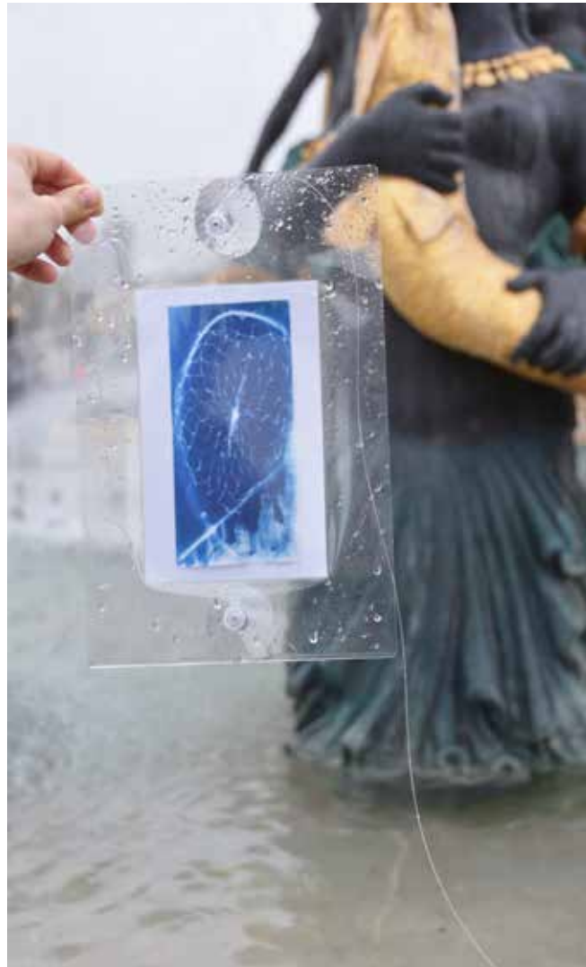
PNF Fishing net /MHB Vb 32009, Shiva Lynn Burgos