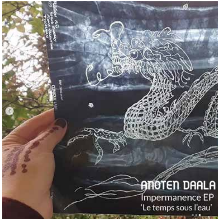
Ryu, dragon d'eau, Anoten Daala