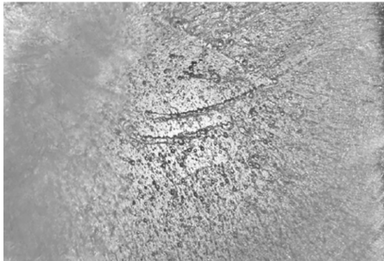
What if water gets it?, Sanaa Goldie