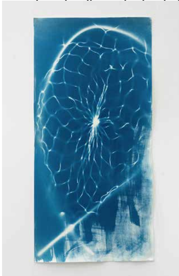
PNG Fishing net /MKB Vb 32009, Shiva Lynn Burgos